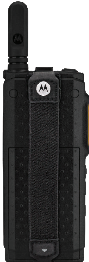
PMLN6074 Nylon Wrist Strap