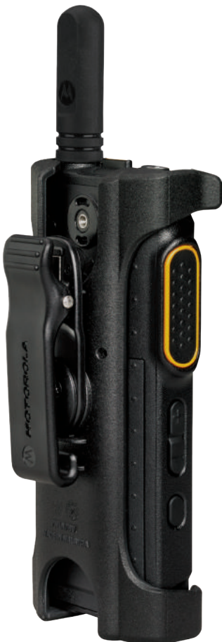
PMLN7190 Carry Holder/Holster with Swivel Belt Clip

By spending countless hours in the field with customers, we've developed accessories that aren't just the most innovative. But also the most useful.